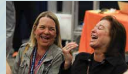
EXHIBIT HALL HAPPY HOUR FRIDAY, APRIL 12 • 5–6 P.M. Enjoy a happy hour while shopping the latest innovations and services. Each attendee will receive one (1) drink ticket to use during the Happy Hour in the Exhibit Hall.

WELCOME PARTY FRIDAY, APRIL 12 • 5:30–7 P.M. Presented By the UMKC Dental and Dental Hygienists' Alumni Associations All registered attendees are welcome to attend!